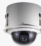
FCS-4300/4400/4500 Day/Night P/T/Z IP Speed Dome Camera